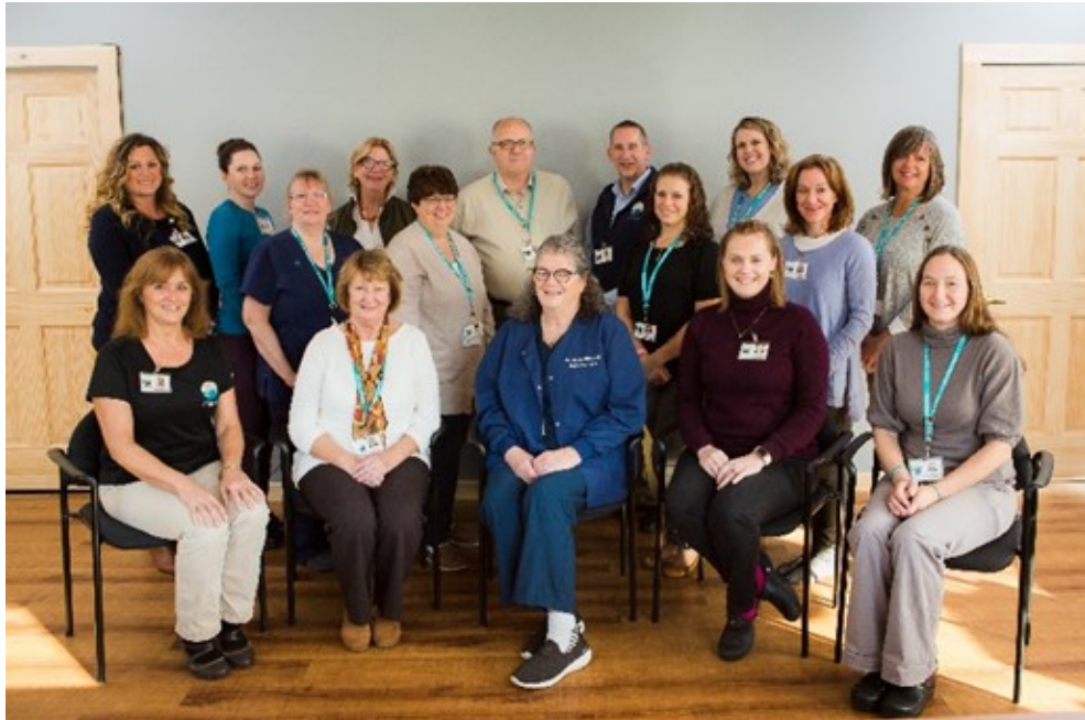
Northern Care Team with Administration