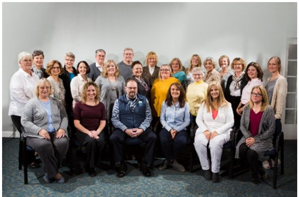
Southern Care Team with Administration