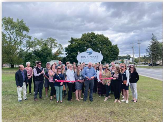
High Peaks Hospice Staff, Volunteers and Board of Directors pose for the official ribbon cutting.

To celebrate this momentous occasion, we hosted an open house kicked off with a ribbon cutting performed by the Adirondack Regional Chamber of Commerce. The event held last September was a testament to our commitment to transparency, community involvement, and our shared journey towards compassionate care.